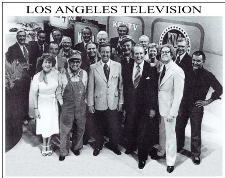
Names of former and current PPB members are underlined.

Los Angeles television history began in the small room of an auto dealership in 1931. Since then, much of the nation's TV history has been made here: the first television helicopter, the first big story that TV broke before newspapers, the first live coverage of an atomic bomb, and the careers of numerous icons. The book contains hundreds of photos and is available at retailers everywhere and on-line.