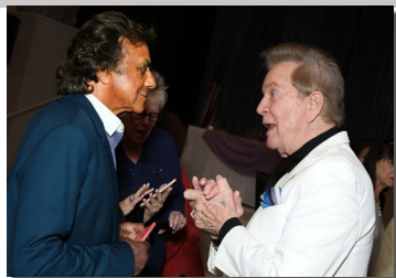
Surprise guest JOHNNY MATHIS and DJ and game show host WINK MARTINDALE .