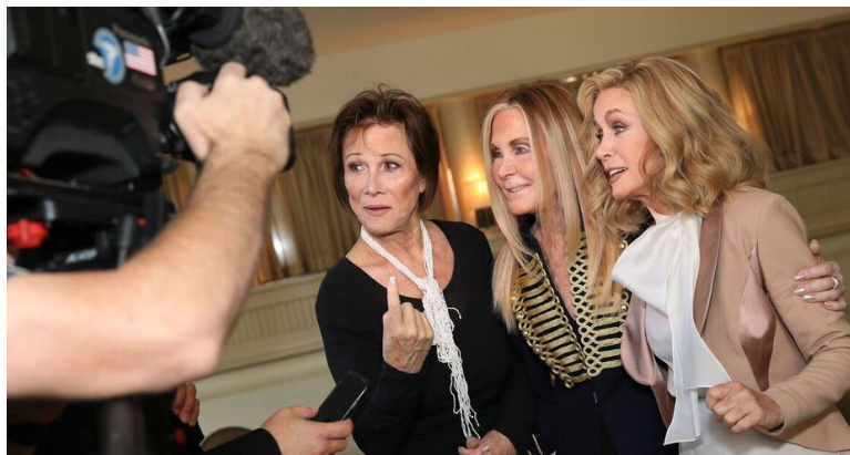
Three of the stars of Knots Landing , one of the longest-running primetime dramas in the United States, hung out in the greenroom before the luncheon. MICHELE LEE , JOAN VAN ARK and DONNA MILLS have remained close friends since the show aired on CBS from 1979 until 1993.